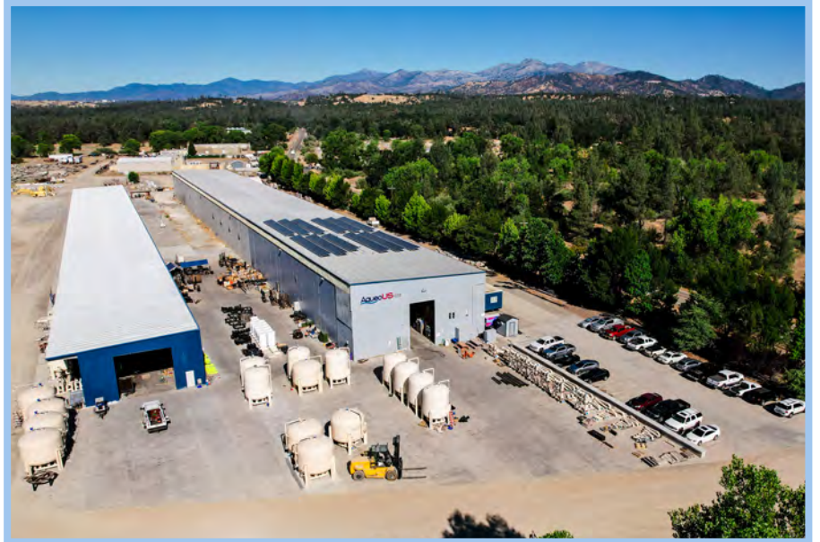
REDDING, CALIFORNIA MANUFACTURING FACILITY